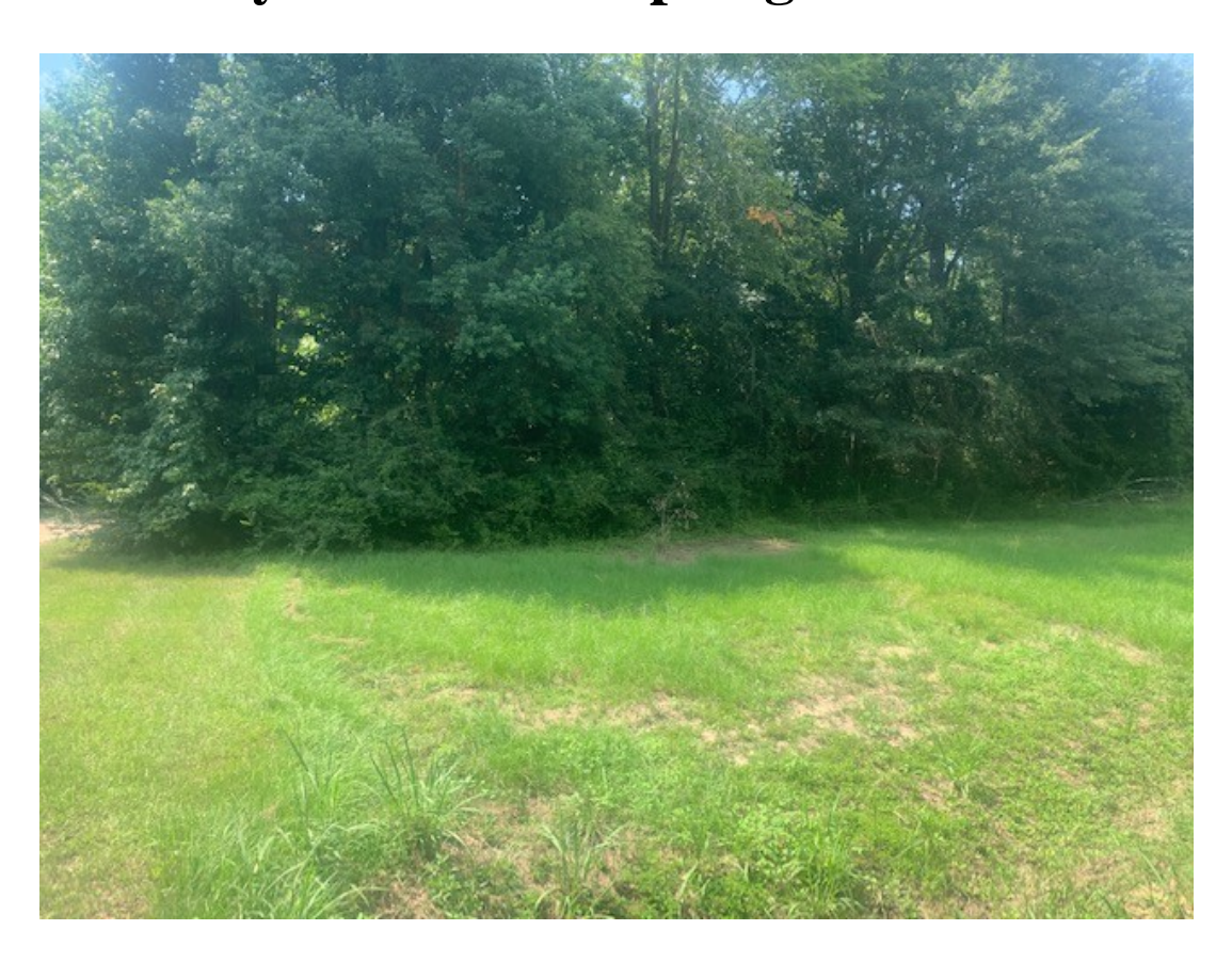
12.00 Acres / $36,000.00

The Huckaby 12 Acres of Springhill is 12 acres of heavily timbered property running along Crooked Creek and road frontage on 7th St. This is priced right at $ 36,000.